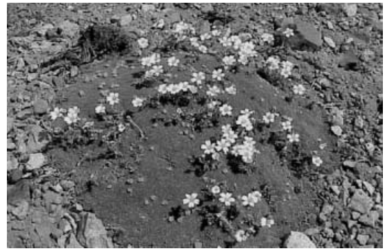
Fig. 1 An Azorella monantha cushion invaded by flowering individuals (white flowers) of Cerastium arvense .

We have tested the above hypothesis by documenting the extent to which a high-Andean ecosystem engineer, the native cushion plant ( Azorella monantha Clos.; Apiaceae; Fig. 1), affects the performance and survival of two common exotic forbs, field chickweed ( Cerastium arvense L.; Caryophyllaceae) and common dandelion ( Taraxacum officinale (L.) Weber; Asteraceae), along an elevation gradient in the high-Andes of central Chile. High-mountain ecosystems represent an ideal system to test our hypothesis because current global change simulation models predict these ecosystems are particularly resistant to biological invasions due to their extreme environmental conditions when